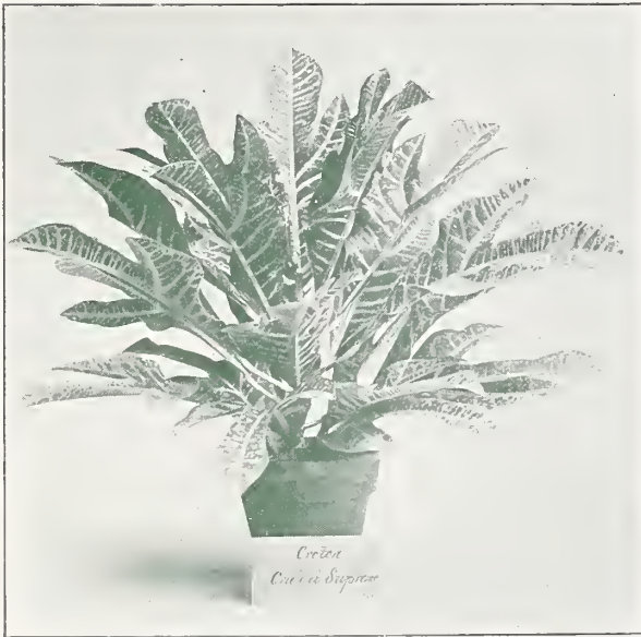
CROTON CRAIGII SUPREME